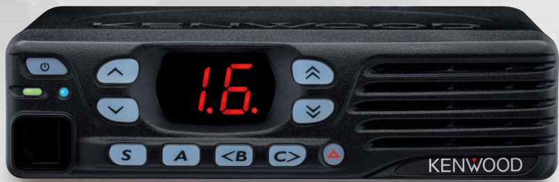
TK-D740/D840 VHF/UHF DIGITAL MOBILE TRANSCEIVER

With their robust performance and clear audio, these radios impressively satisfy the requirements of a wide range of professional fields.