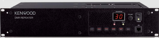
TKR-D710/D810 VHF/UHF DIGITAL REPEATER