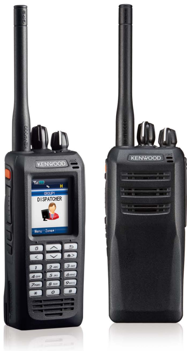
TK-D200(G)/D300(G) VHF/UHF DIGITAL PORTABLE TRANSCEIVER

KENWOOD's handheld TK-D200(G)/D300(G) provides all the benefits of advanced digital technology to increase the efficiency of your business.