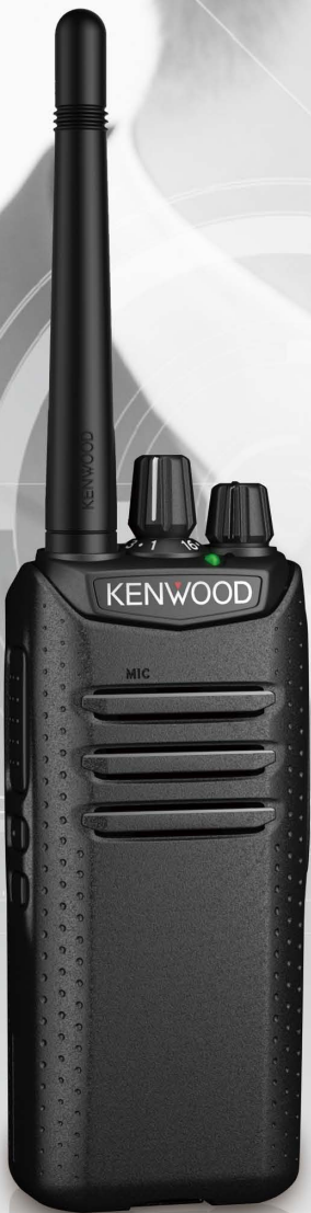
TK-D240/D340 VHF/UHF DIGITAL PORTABLE TRANSCEIVER